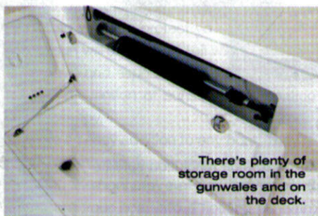
There's plenty of storage room in the gunwales and on the deck.