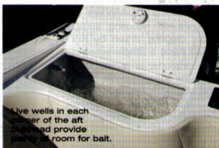
Five wells in each corner of the aft cockpit provide plenty of room for bait.

FISHERMEN can be fickle. I've always looked at Powercat's 2600 Sports series and wished they'd do a full-on fishing version. And when they released the 2500 Sports Fisherman (same hull, some new mouldings), I looked at the space where Powercat's trademark central living unit usually sits and wondered if I could live without it!